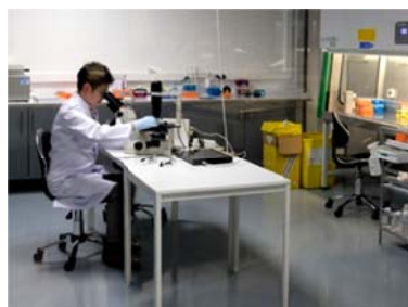
Research scene (for illustrative purposes only)