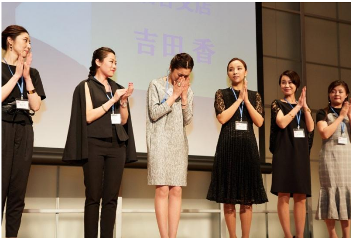
The announcement of the winner

*EMB stands for “Expectation, Meet, Beyond” and is meant to imply people who not only meet, but also exceed expectations.